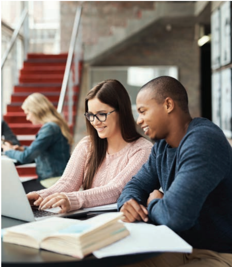
SHAPECHARGE | ISTOCK.COM