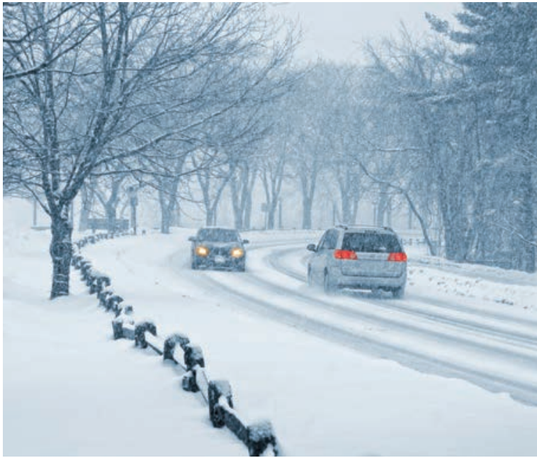
NUJ1224 | ISTOCK.COM