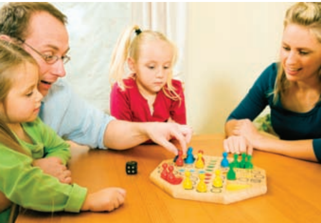
2010 © KEENON. IMAGE FROM BIGSTOCKPHOTO.COM